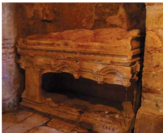
Ο τάφος του Αγίου Νικολάου στα Μύρα της Λυκίας